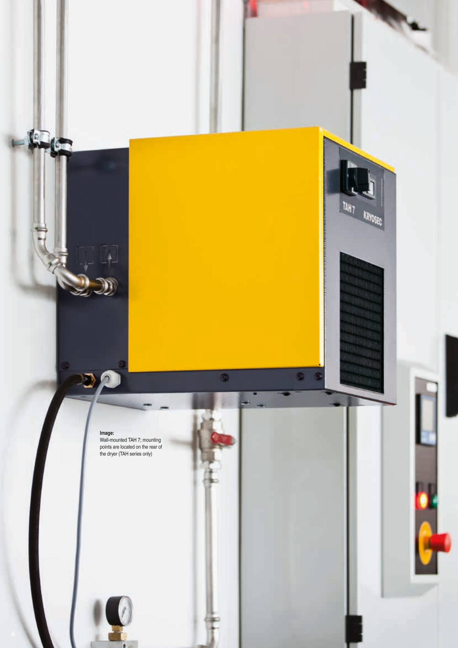
Image: Wall-mounted TAH 7; mounting points are located on the rear of the dryer (TAH series only)