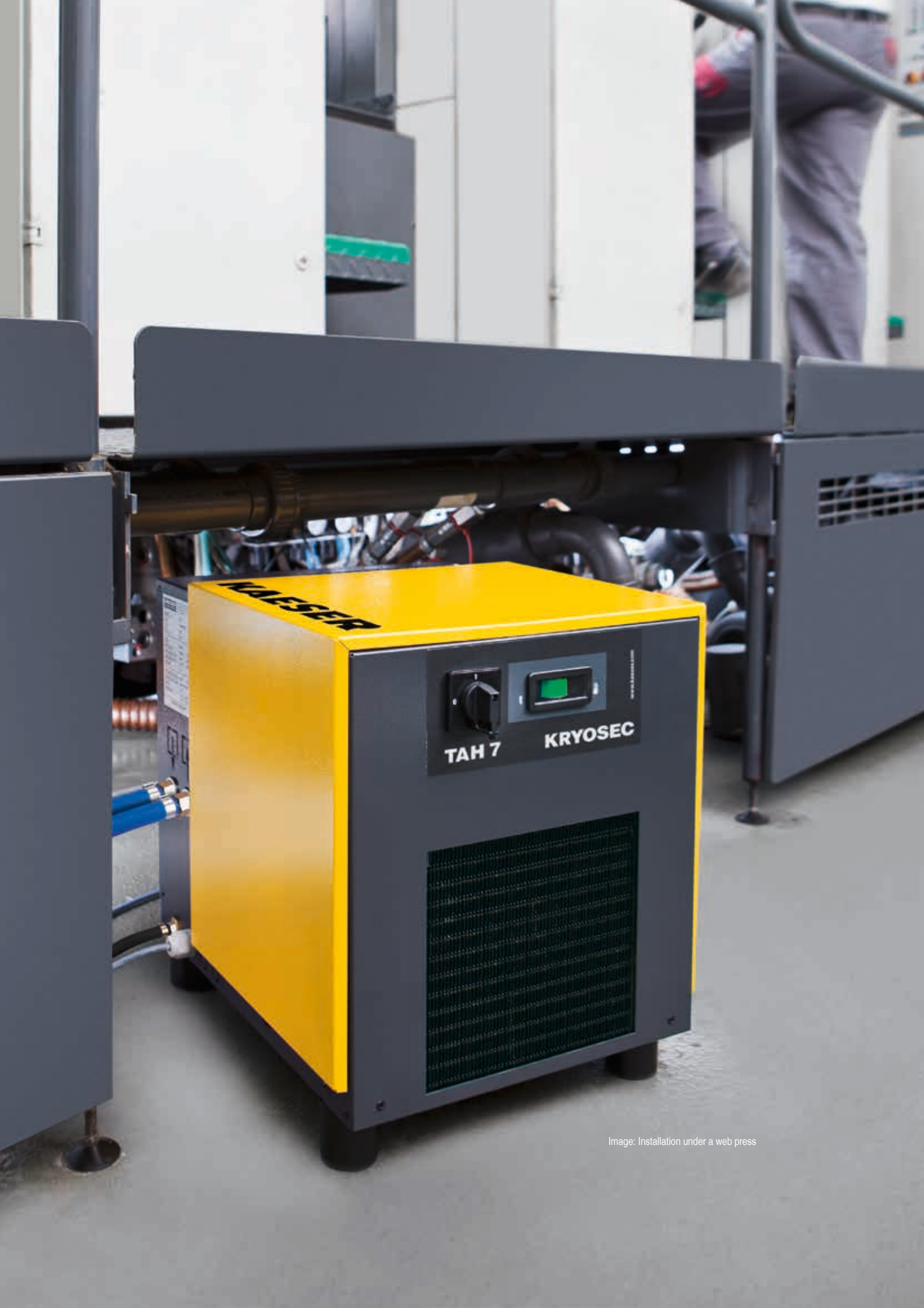
Image: Installation under a web press