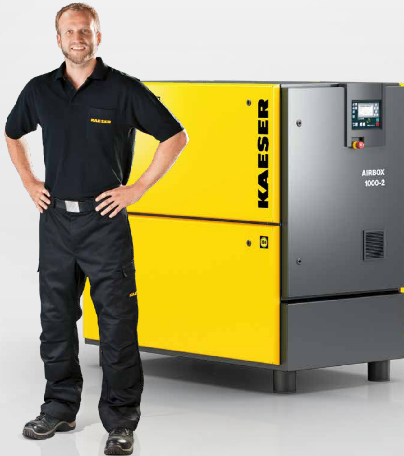
Image: AIRBOX 1000-2