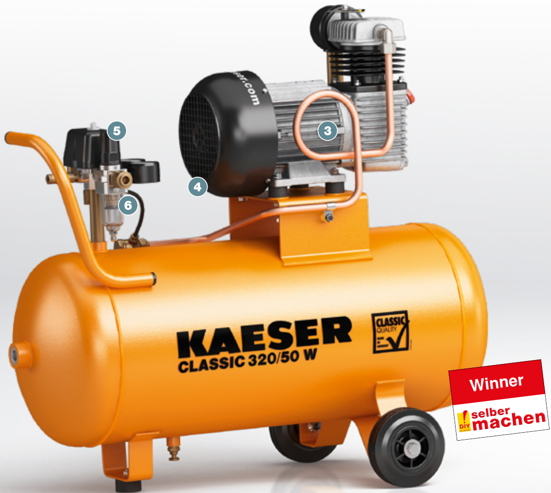
Image: CLASSIC 320/50 W