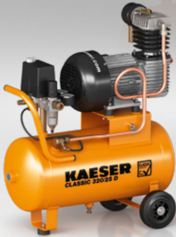
Image: CLASSIC 320/25 D