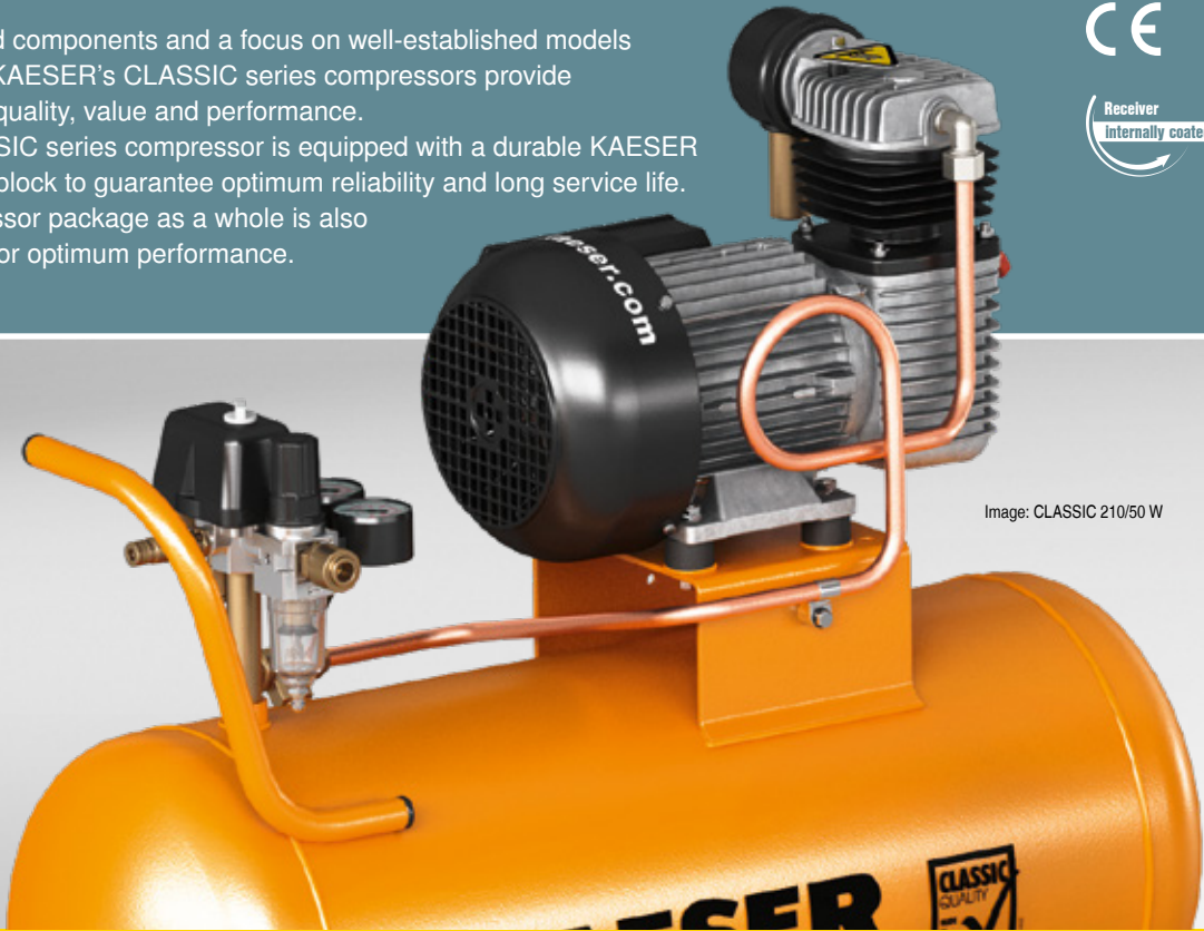
Image: CLASSIC 210/50 W