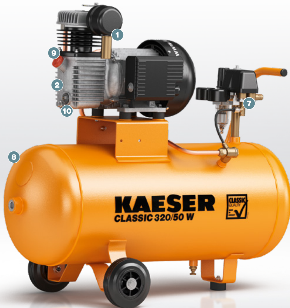
Image: CLASSIC 320/50 W