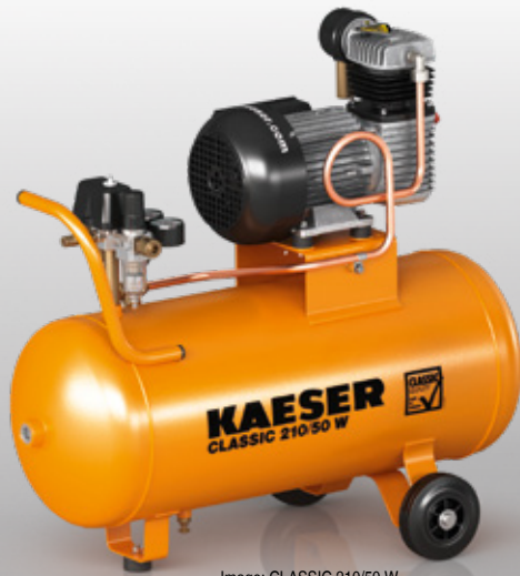
Image: CLASSIC 210/50 W