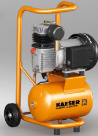
Image: CLASSIC mini 210/10 W