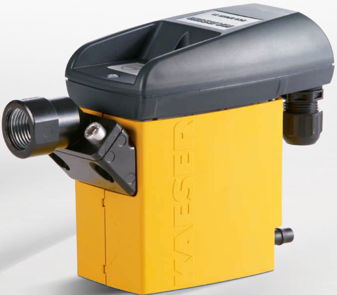
Image: ECO-DRAIN 31