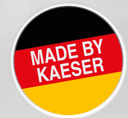
Image: TAH 7