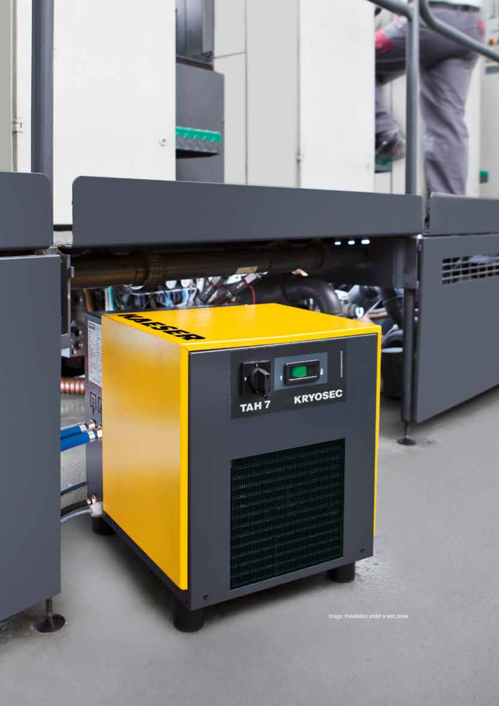
Image: Installation under a web press