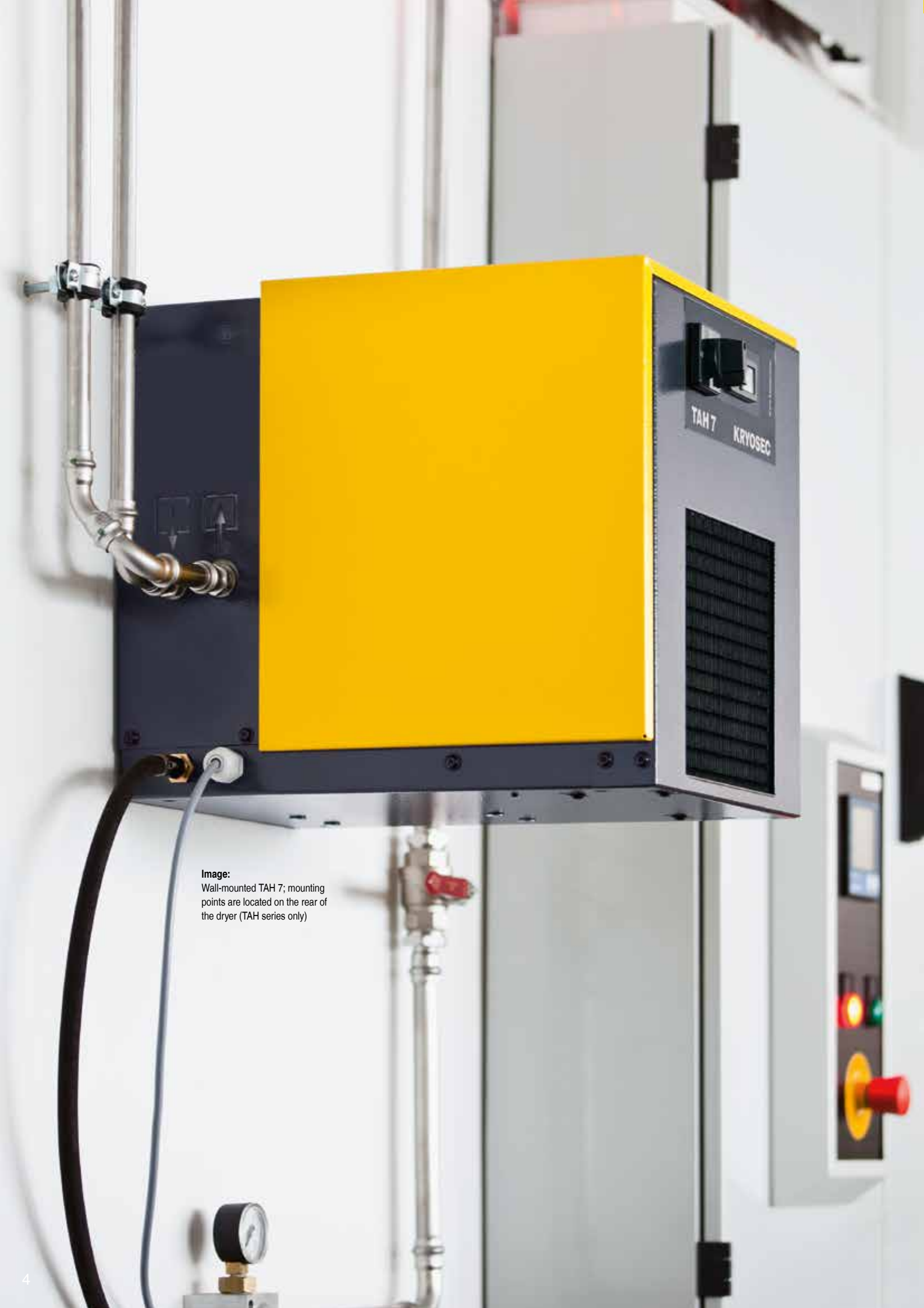
Image: Wall-mounted TAH 7; mounting points are located on the rear of the dryer (TAH series only)